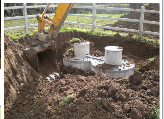
And back fill

Consider these points before purchasing any system: