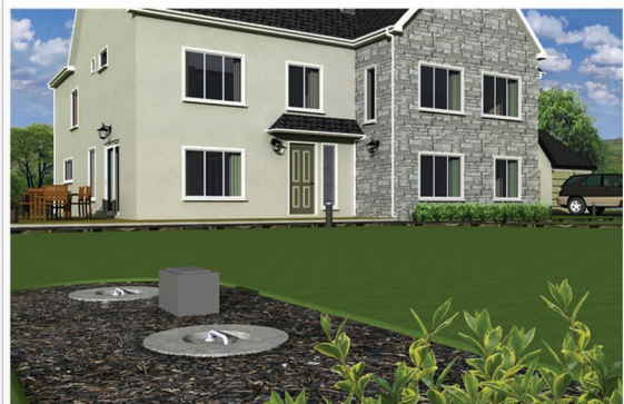
Ground Level view of of Bio Uro Clean system