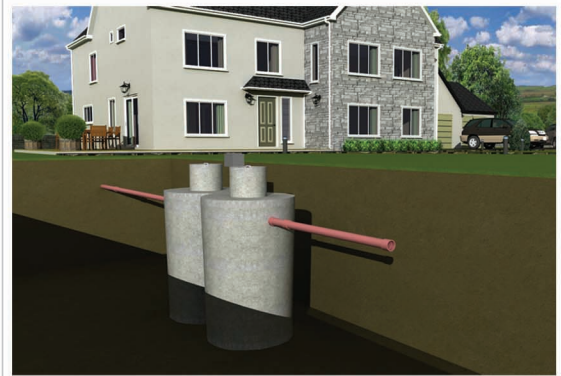
Underground setup of Bio Uro Clean system